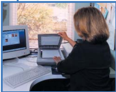
• Practice Manager at front desk scanning