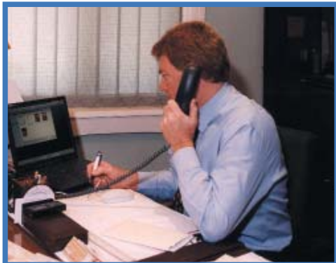
• Doctor in consulting room viewing the scans